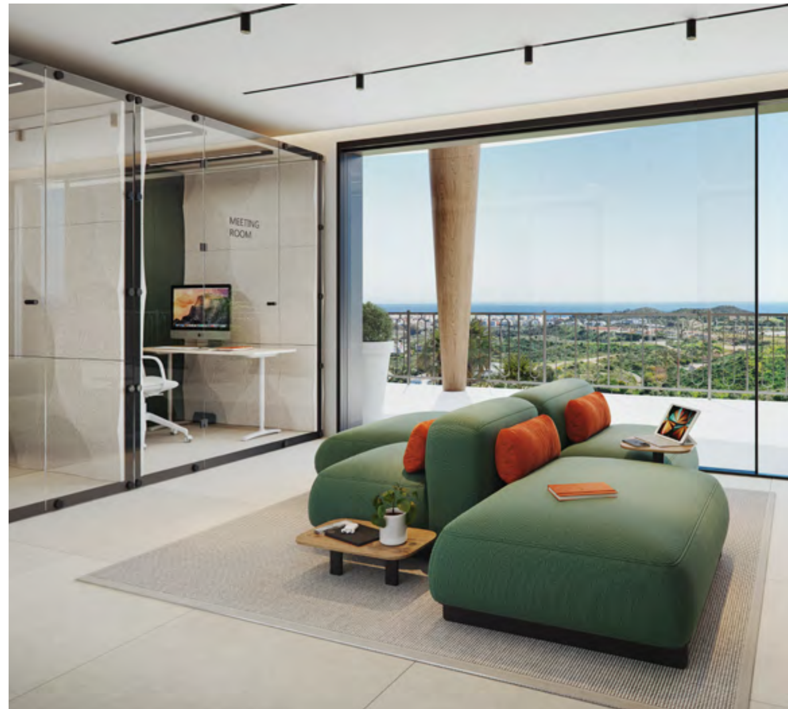
STATE-OF-THE-ART COWORKING SPACE