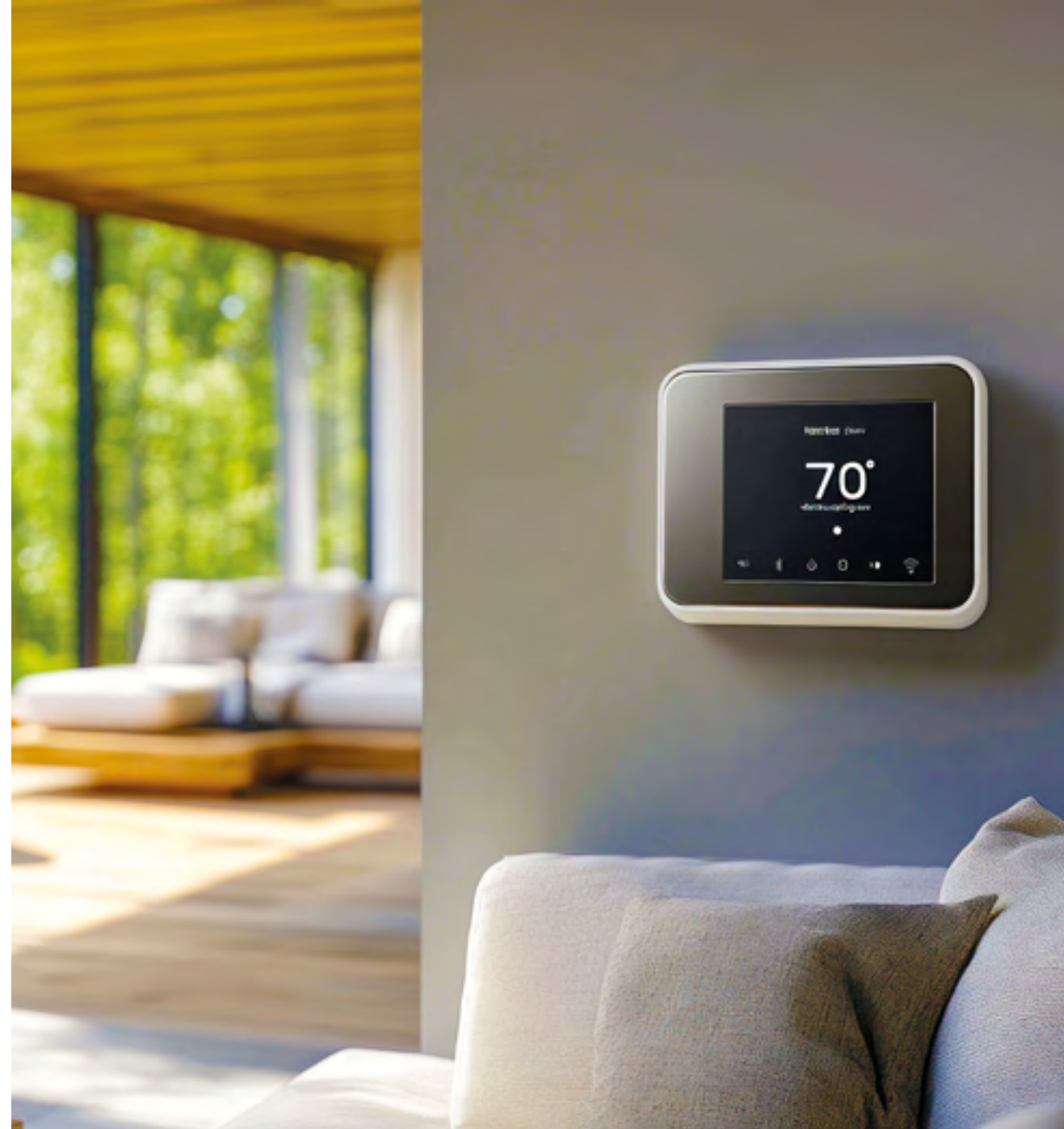
ADVANCED SECURITY SYSTEMS & SMART HOME TECHNOLOGY