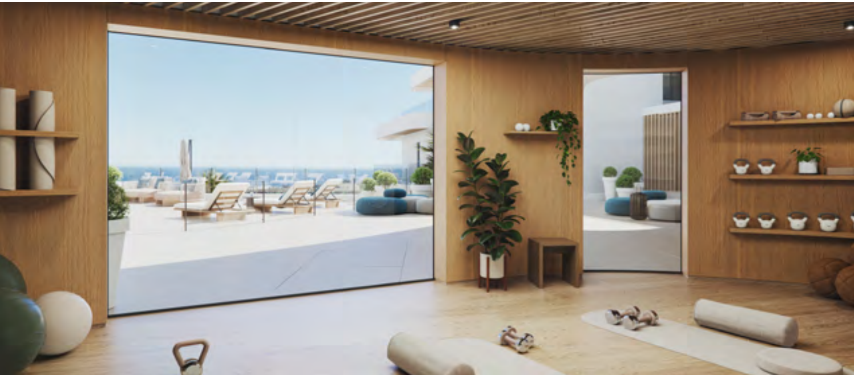
FULLY EQUIPPED GYM AND YOGA ROOM